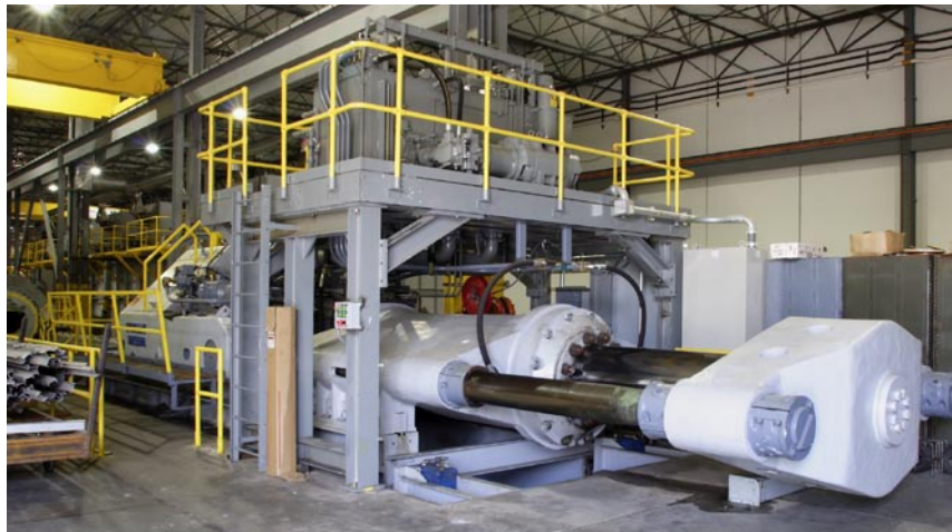
1,500-ton stretcher headstock.

Additional systems in the extrusion press overhaul include a 60-gallon hydraulic power unit and manifold to control the clamping and feed of the large run-out saw used to cut extrusions coming off the press. Also, an 850-gallon hydraulic system with reservoir, motor pump groups and manifolds were