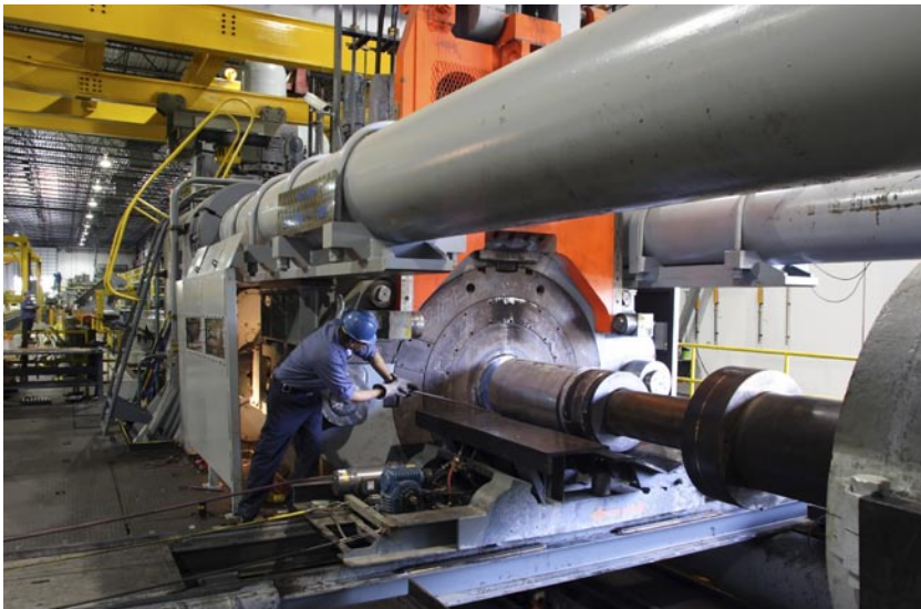
Billet load - beginning of cycle.

Universal Alloy Corporation (UAC), a business unit of Alu Menziken Aerospace Group of Switzerland and manufacturer of soft, hard and metal matrix composite aluminum alloys, recently purchased and upgraded the world's largest indirect extrusion press to expand its aerospace market offering. Built in the 1940s in Germany, the 122-foot extrusion press was originally used in World War II. UAC purchased the press from Spectrulite Consortium, Inc., in St. Louis, MO, becoming its fourth owner. The press, which