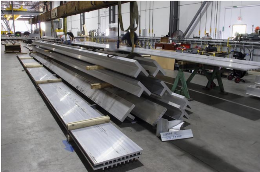
Final product: Heavy press aerospace extrusions.

press in Georgia, UAC now provides greater service to East Coast aerospace markets. The addition of the press expands UAC's aluminum extrusion offering from aircraft fuselage components to wing components, including stringers, planks and panels for military and commercial applications. "Currently, the extrusion press can produce a 32-inch billet in the direct mode